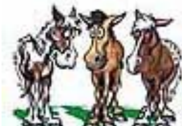
Nag Nag Nag

If you only receive the newsletter via the website, then I have included a list of names and expiration dates in the body of the e-mail.